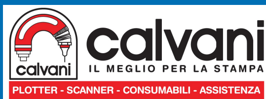
IMAGE ACCESS GMBH

Hatzfelder Str. 161-163 42281 Wuppertal, Germany Phone: +49 202 27058-0