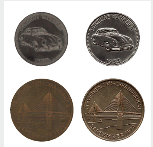
2D scan versus 3D scan, capture all details